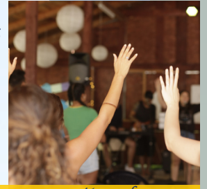
A new generation of worshippers are taking their place

Although at the time it seemed like something that was just a bit of fun, and also quite rebellious (culturally, going out in the rain and getting soaking wet is a big no no) on reflection, it was something liberating for many and an activity which brought joy, laughter and freedom to the whole atmosphere of camp. A Godly downpour!