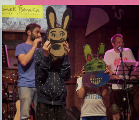
Young Leaders are taking to the stage