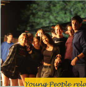
Young People relaxing in the evening

A recent study by Alpha showed that the current generation of young people are deeply curious about God. This resonates with what we are seeing in Bosnia and Herzegovina.